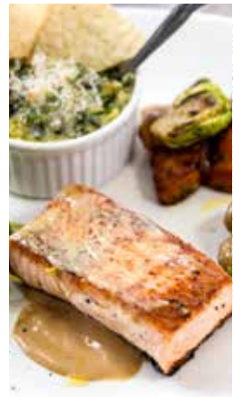
PAN ROASTED ATLANTIC SALMON